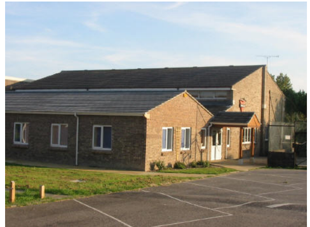
The YMCA Hall where we meet on Sundays

We learn too from the Scriptures that God hears even the young ravens that call on Him. (Job 38:41) So no one need despair of being heard by God. But those who are His children by grace