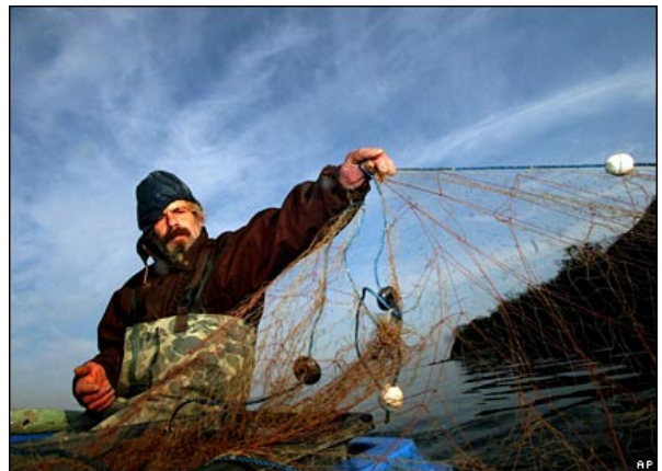
Professional fishing is hard work

What does that have to do with how the church evangelises? And how is that really any different from how we currently "fish?" I think fishing in the sense of today's rod-and-reel fishing effectively describes "seeker sensitive" evangelism. You throw out your bait: children's